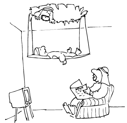
'You've got the wrong house!'