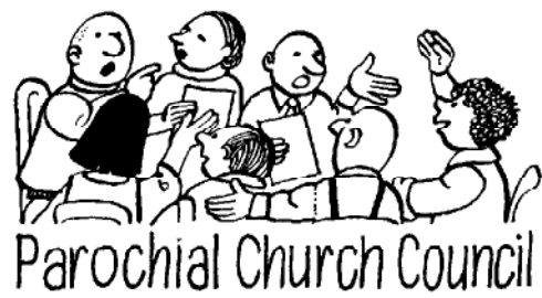
Parochial Church Council